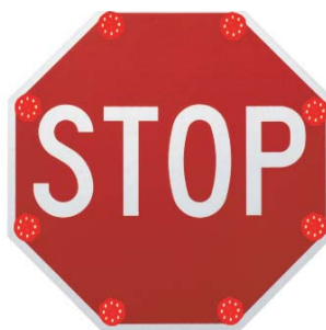
R1-1 Stop Sign

Two 4-inch amber LEDs, one at each side; or five 2-inch amber LEDs, one at each corner.