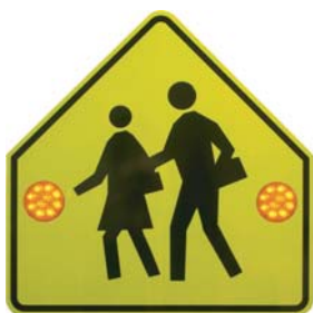
S1-1 School Zone Sign

Provides increased safety at locations such as crosswalks, school zones, parks, playgrounds, shopping malls, and hospitals.