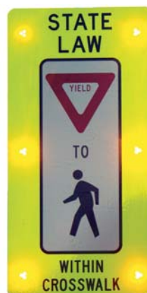
R1-6 State Law Yield to Pedestrian

Two 4-inch LEDs (above); or four 2-inch LEDs, one at each corner.