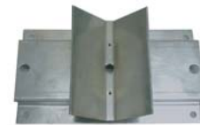
Universal Mounting Bracket

Supplied with all signs for easy installation. For banding, strapping or bolting of signs to poles, street lights, etc.