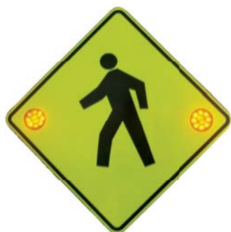
W11-2 Pedestrian Crossing Sign

Two 4-inch LEDs (above); or four 2-inch LEDs, one at each corner.