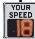
SchoolSign with optional SpeedSign